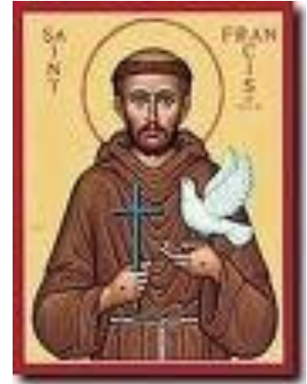
Image of St. Francis holding a cross with the stigma on his hands and a dove (symbolic of the Holy Spirit)

Reflection: Francis followed the example of Jesus closely by living a life of simplicity and teaching others the Gospel message with great joy.